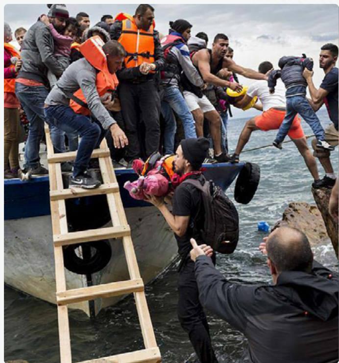
Ph. Zalmi/Human Rights Watch, 2015

The great editorial effort that has been trying to contrast the dominant fiction sold in the mass media has continued to reap rewards: over 255 thousand users (more than 20 thousand per month) have read Open Migration articles on the dedicated website.