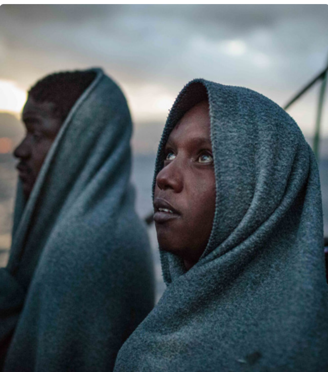
Ph. Valerio Muscella, 2020

CILD currently collaborates with the International Rescue Committee (IRC) for the purpose of creating and reviewing content for the Refugee.Info Italy platform. Refugee.Info Italy aims to help asylum-seekers, refugees and migrants to access services and exercise their rights. Content published on this platform is created on the basis of an ongoing needs assessment conducted by IRC by engaging in two-way communication with English-speaking migrants. This is done through a Facebook group and a Facebook page that allow IRC to document in real time the concerns and questions of people regarding the move across geographies and in Italy. CILD's contribution consists of producing content and checking legal information concerning advice for asylum-seekers, refugees and migrants in Italy. This includes, for example, procedures for seeking asylum, enrolling in school, accessing health care, or renewing documents.