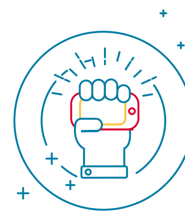
Civil liberties in the digital age