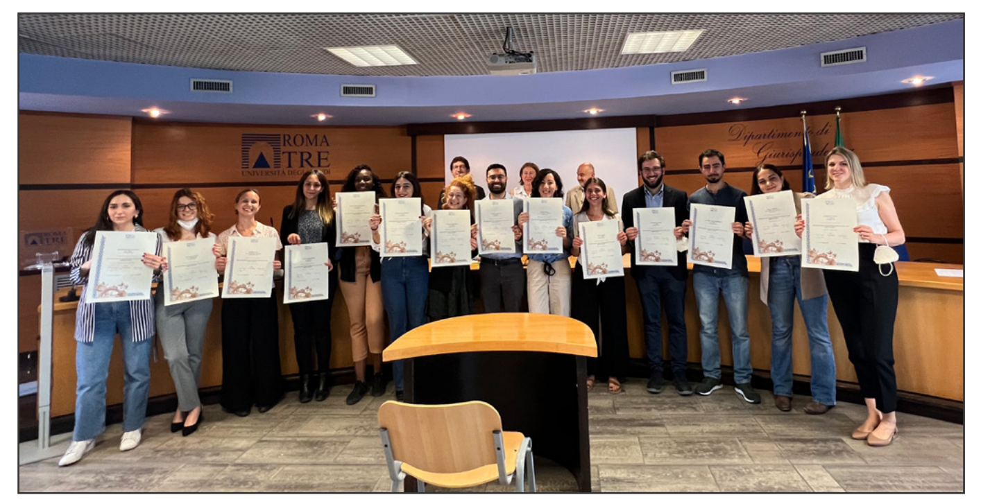
The 2022 course cohort with their certificates of completion

On the course website <u>www.corsodirittiumani.eu</u> interested persons can download the <u>course e-book</u> which contains some of the contributions of the lecturers who took part.