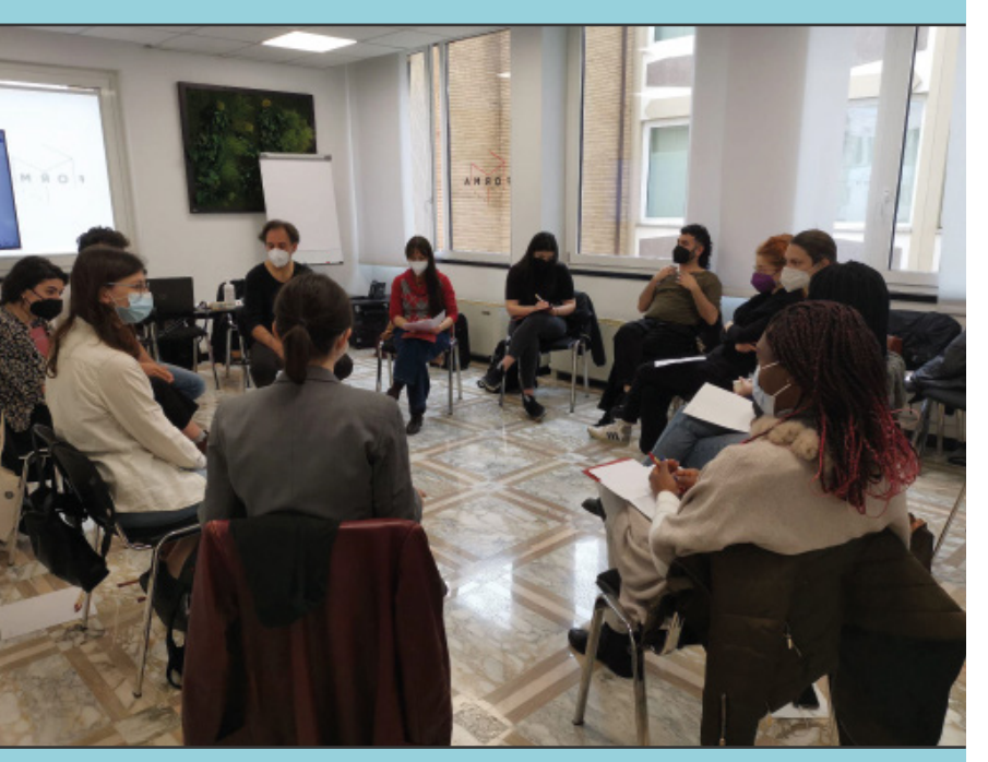
Media Academy participants during one of the face-to-face sessions