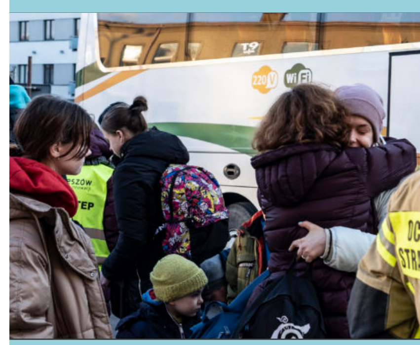
Ukranian refugees in Rzeszów station.

To assist with the many needs of incoming Ukrainian refugees, including unaccompanied minors and other particularly vulnerable groups, CILD commenced the SUNI and UCRI projects, alongside Progetto Diritti, the Association of Ukrainian Women in Italy, and other partners, designed to provide assistance (including legal assistance) and accessible information to Ukrainian nationals. This assistance spans guardianship, family reunification, education, benefits, and immigration and is delivered primarily in Rome, Naples, and Sicily.