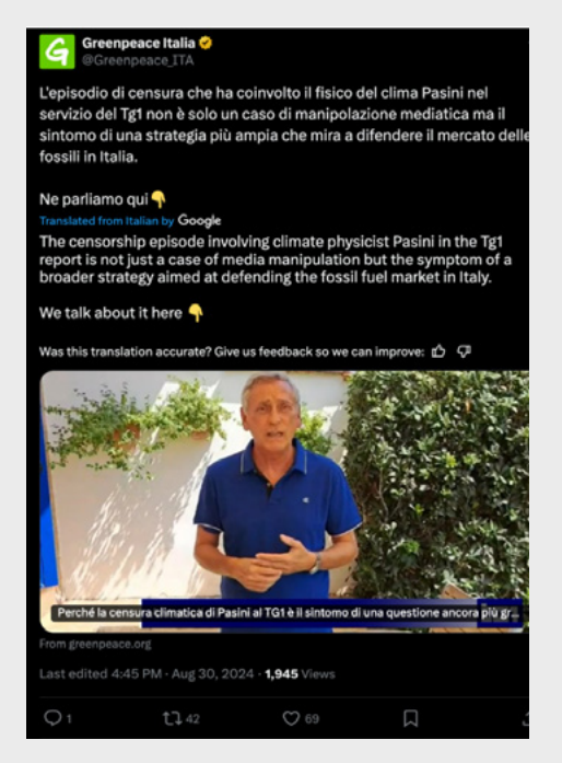
@Greenpeace_ITA Via X

Greenpeace Italy denounced such as a case of media manipulation and part of attempts by the government to spread disinformation. This event adds to the worrying context reported in collaboration with the Pavia Observatory, which documented a significant reduction in media coverage of the climate crisis and an increase in the platforming of those who oppose the ecological transition.